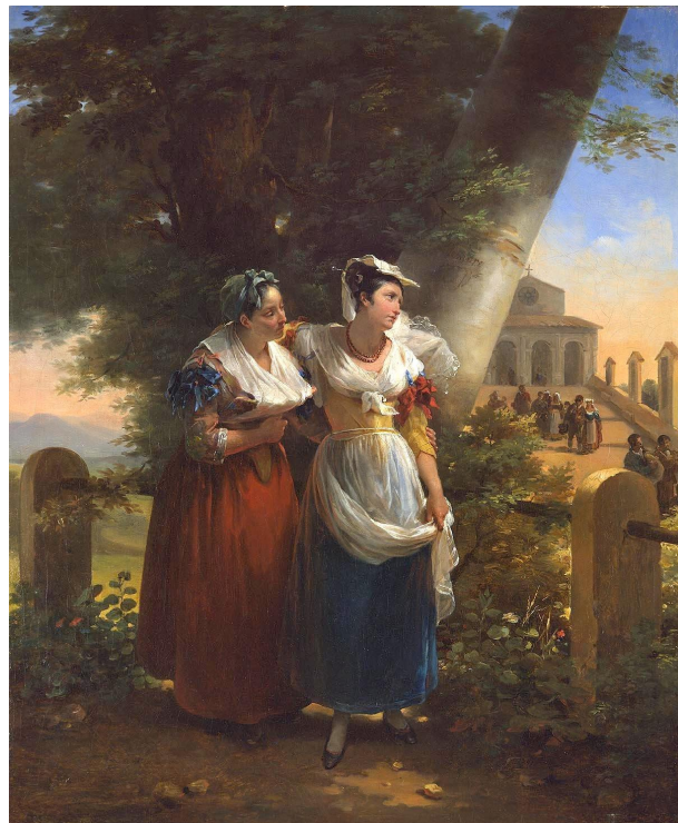
Fig. 4, Hortense Haudebourn-Lescot, Two Italian women , oil on canvas, 47 x 38 cm, Private Collection

Bursting with colour and vitality, the present work is a delightful example of Haudebourn-Lescot's genre scenes and is related to a small painting by the artist in a private collection (fig. 4). Hiding out of sight behind a couple of trees, an elderly mother reassuringly wraps her arm around the waist of her tearful daughter, supporting her both emotionally and physically. The couple, in the timeworn contrast of youth with old-age, discreetly watch a joyful wedding procession exit a hilltop church in the Roman campana. The young woman's lover, who had previously declared his undying love for her by carving an arrow-pierced heart below the word 'Sempre', has married another. However, the lush vegetation and blossoming flowers point renewal and regeneration – in the end, time heals all. An engraving entitled ' L'Abandon ' after the painting was exhibited at the Salon in 1831, and therefore potentially gives an approximate date for both the painting and the watercolour, demonstrating Haudebourn-Lescot's continued interest in Italian themes upon her return to France.