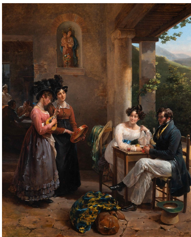
Fig. 2, Hortense Haudebourg-Lescot, The artist and her husband on their wedding trip , 1821, oil on canvas, 61 x 51 cm, Clark Art Institute