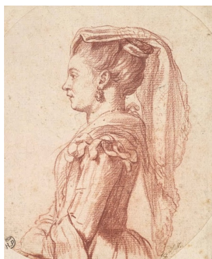
Fig. 1, Jacques-Louis David, A young woman of Frascati , c. 1775, red chalk on paper, 15.3 x 13.7 cm, Metropolitan Museum of art